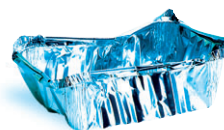
➤ aluminium pastry boats