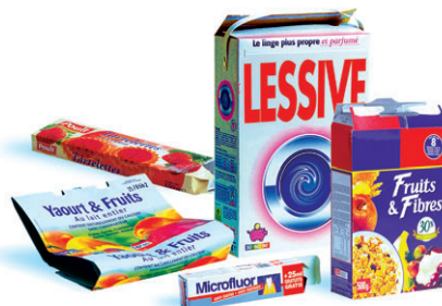
➤ cardboard boxes