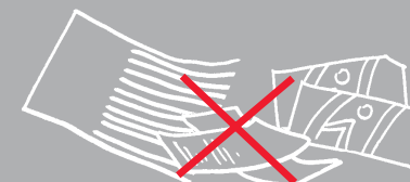
Shredded paper and bus tickets ...