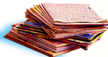
➤ newspapers, leaflets and magazines