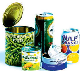
➤ tincans and tins

I put them in bulk and empty them in the dustbin with yellow lid