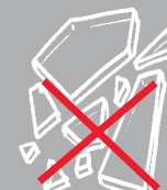
Broken glass or mirrors, windscreen