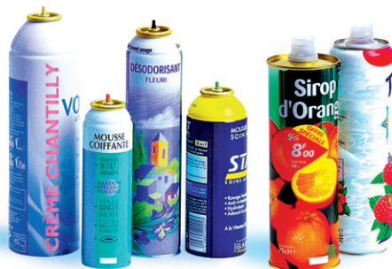
➤ sprays and tins