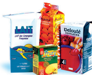
➤ soup, milk, fruit juice cartons

I put them in bulk and empty them in the dustbin with yellow lid